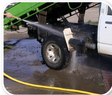
Ensure all vehicles are free of soil and plant material before entering and leaving the farm

For a full list of Grains Biosecurity Officers in your region, scan the QR code or visit grainsbiosecurity.com.au/contact