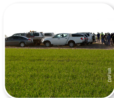
Providing areas for visitor parking for field days, contractors etc. helps to reduce the area of the property put at risk

If you see anything unusual, call the Exotic Plant Pest Hotline