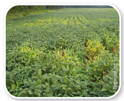
Check and seek advice about poorly preforming areas

Do not send samples until you have received advice on the correct way to sample, pack and transport them to a laboratory assigned for diagnosis.