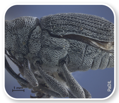
Cabbage seed pod weevil, an exotic pest of canola.

The Grains Farm Biosecurity Program is managed by PHA and funded by growers through Grain Producers Australia together with the governments of New South Wales, Queensland, South Australia, Victoria and Western Australia. Grains Biosecurity Officers in these five states develop and deliver materials to raise awareness and deliver training to growers, consultants and other industry stakeholders. Go to grainsbiosecurity.com.au for more information.