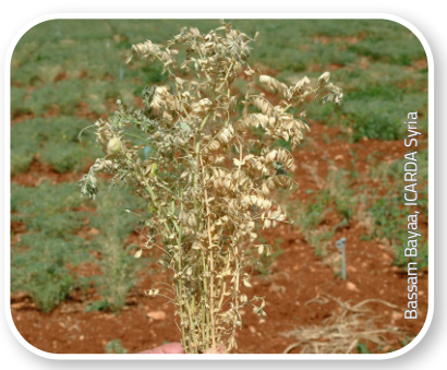
Check and seek advice about poorly