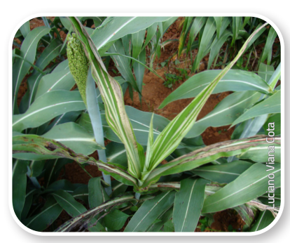
Sorghum downy mildew an, exotic pest of sorghum.