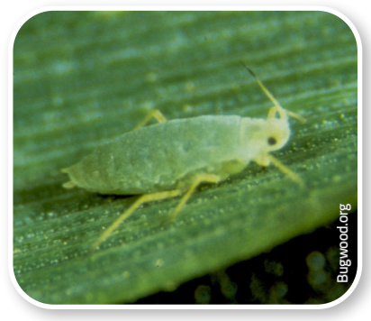
Russian wheat aphid, an exotic pest of winter cereals.